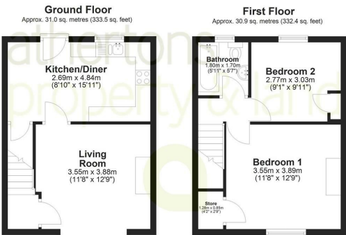
Total area: approx. 61.9 sq. metres (665.9 sq. feet)